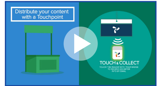
The Smarter Exhibition for Exhibitors